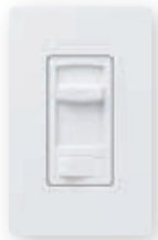
Skylark Contour™/C•L* Gloss colors