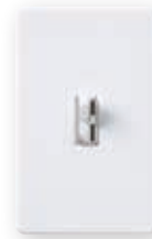
Ariadni®/C•L Gloss colors Coming Soon