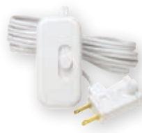
Credenza®/C•L Black (BL), White (WH), and Brown (BR)