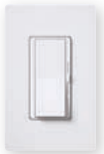
Diva®/C•L Gloss and Satin Colors®